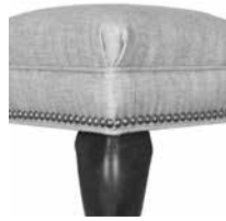
X Welt Inside/ Small Nail Edge