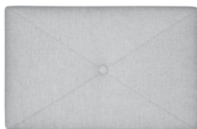
Q Mitered with Button