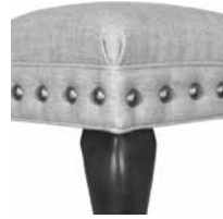
Y Centered Large

For nail option X & Z , please specify Small Brass, Small Chrome, Small Cinder, Small French Natural, Small Platinum, Small Pinwheel Antiqued Gold or Small Pinwheel Nickel.