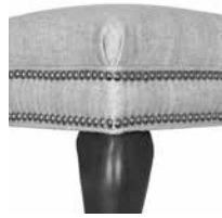
Z Small Nail Inside/ Small Nail Edge