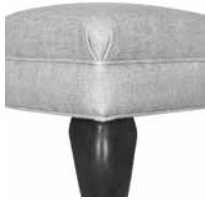
W Welt Inside/ Well Edge