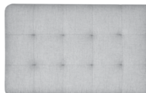
I Square Buttonless Tuft