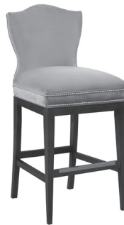
B Shield Back