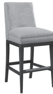
C Square Back