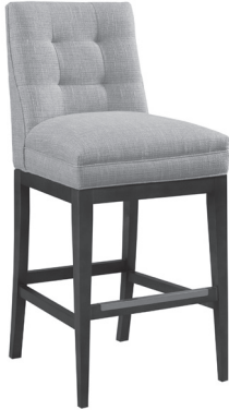
6 B S Bar Stool