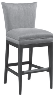
A Scoop Back