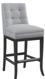
U Stationary Flared Leg