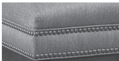
X Nailhead Trim

Nailhead trim located along each side, across the top and as a double row around the base. For nail option, please specify small brass, small chrome, small cinder, small French natural, small platinum, small pinwheel antique gold, or small pinwheel nickel.