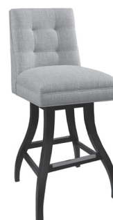
V Swivel Base

Standard Walnut Finish. Optional Finish Ebony, Ember, Fawn, French Oak, Fruitwood, Kahlua, Natural, Sable, and Slate. Standard with Metal Kickplate. Please specify French Natural or Platinum finish.