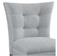
P Buttonless Tufted