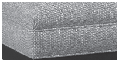
W Welt Edge