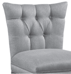
O Button Tufted