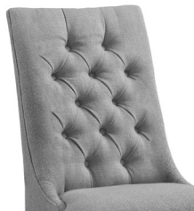
O Button Tufted