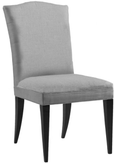
4 D 1 Chair