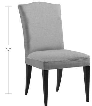
E Camel Back