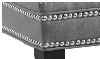
X Nailhead Trim

Nailhead trim located along each side, across the top and as a double row around the base. For nail option, please specify small brass, small chrome, small cinder, small French natural, small platinum, small pinwheel antique gold, or small pinwheel nickel.