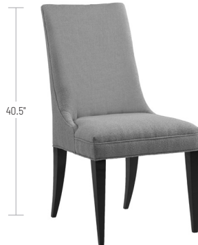
D Square Back