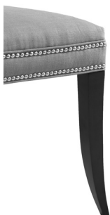
U Flared Leg