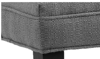
W Welt Edge