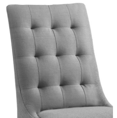
P Buttonless Tufted