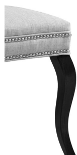
S Cabriole Leg