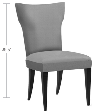
G Greek Back