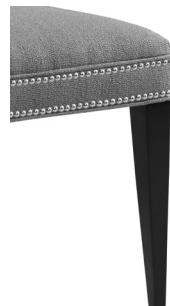
T Straight Tapered Leg

Standard Walnut Finish. Optional Finish Ebony, Ember, Fawn, French Oak, Fruitwood, Kahlua, Natural, Sable, and Slate.