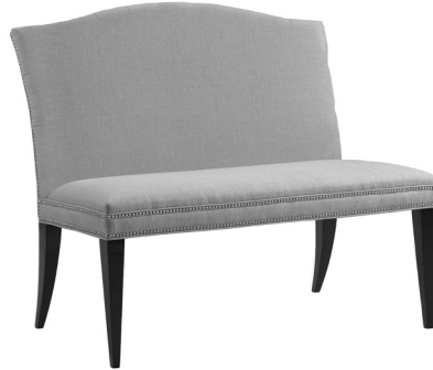
4 B Q Banquette

Seat Height = 19" Inside Seat Depth = 18" Chair Width = 22" Banquette Width = 51"