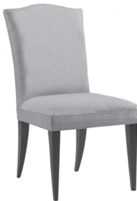
Chair W22" Inside Seat: W22" D18"