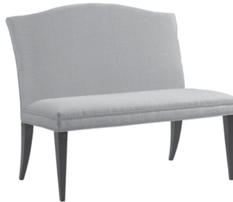
Banquette W51" Inside Seat W51" D18"