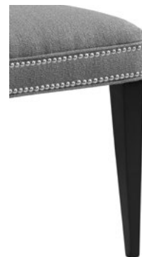
Straight Tapered Leg

Standard Walnut Finish. Optional Finish Belgian Grey, Dove, Driftwood, Ebony, French Oak, Fruitwood, Kahlua, Sable, and Slate.