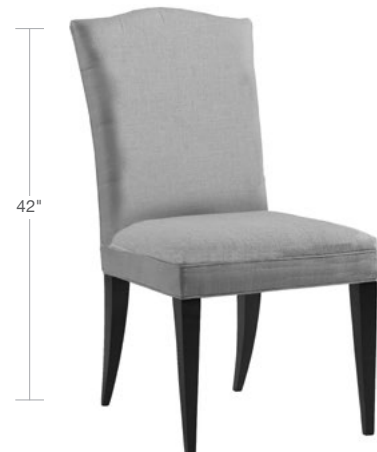
Camel Back H 42"