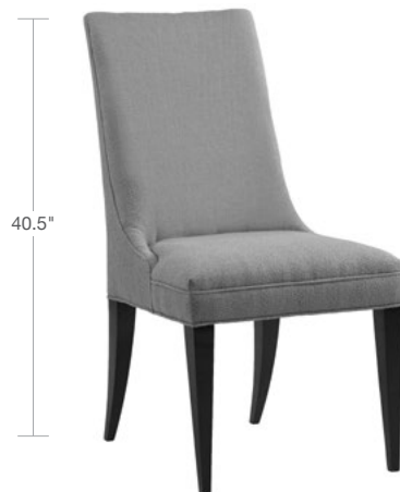
Square Back H 40.5"